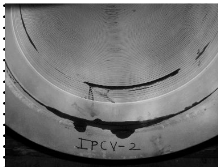
IPCV – Bush cracked