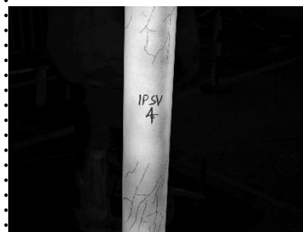
IPCV – Cracks on spindle

The Emergency Stop valves are provided for rapid interruption of steam flow in emergency situations like on-load unit trip to protect the over-speeding of turbo-generator and subsequent failure.